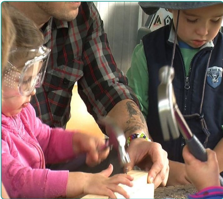
Children at the woodwork bench, Dorothy Waide Early Learning Centre. From the NQS PLP Talking about practice series video: Being Adventurous .

Cooking, gardening and woodwork are all examples of experiences that provide opportunities to use real tools or utensils and complete real 'adult' work. The sense of satisfaction that comes from doing something 'grown up' is hard to overestimate. Children live in a world where they are continually reminded that they are not 'grown up' yet, and that there are many things they are 'not yet ready' to do. Often there are good reasons for such restrictions. But even so, the constant feeling of not being able to do things can be damaging to children's sense of self and their ability to demonstrate their capabilities (rather than just their limitations). Perhaps this is why children respond so enthusiastically to real tasks.